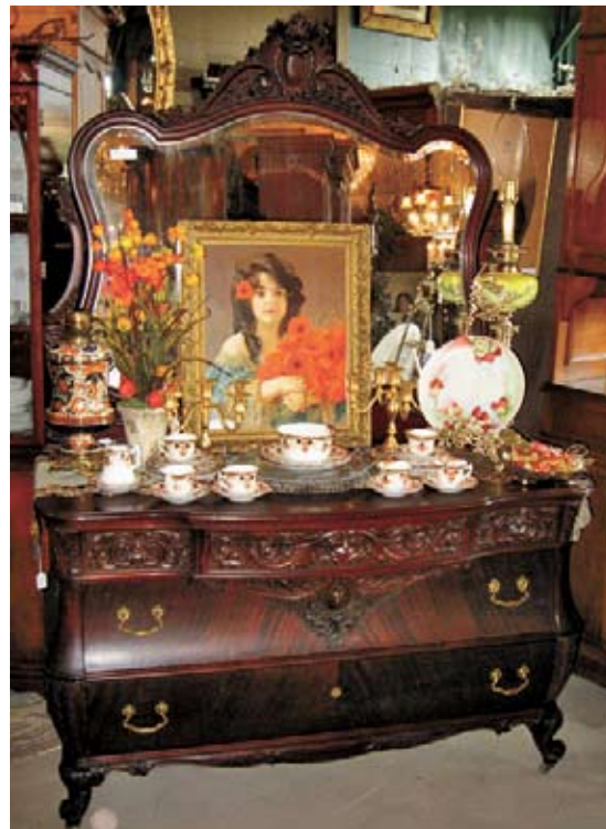
Thoughtful and creative displays of the many traditional and unusual pieces available at the huge Antique Revival Showroom.