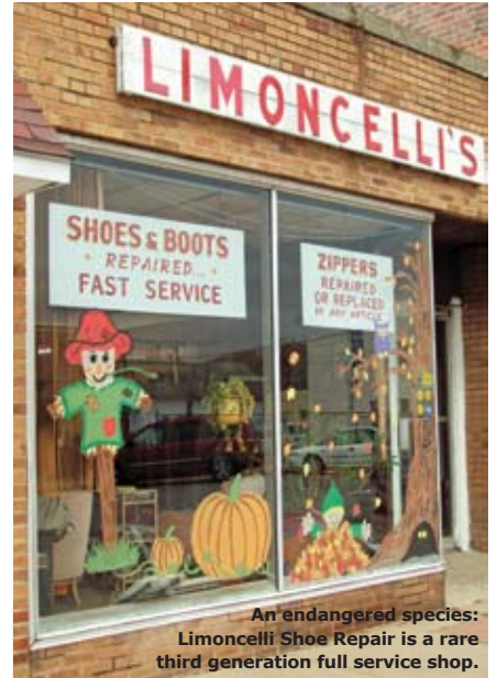
An endangered species: Limoncelli Shoe Repair is a rare third generation full service shop.